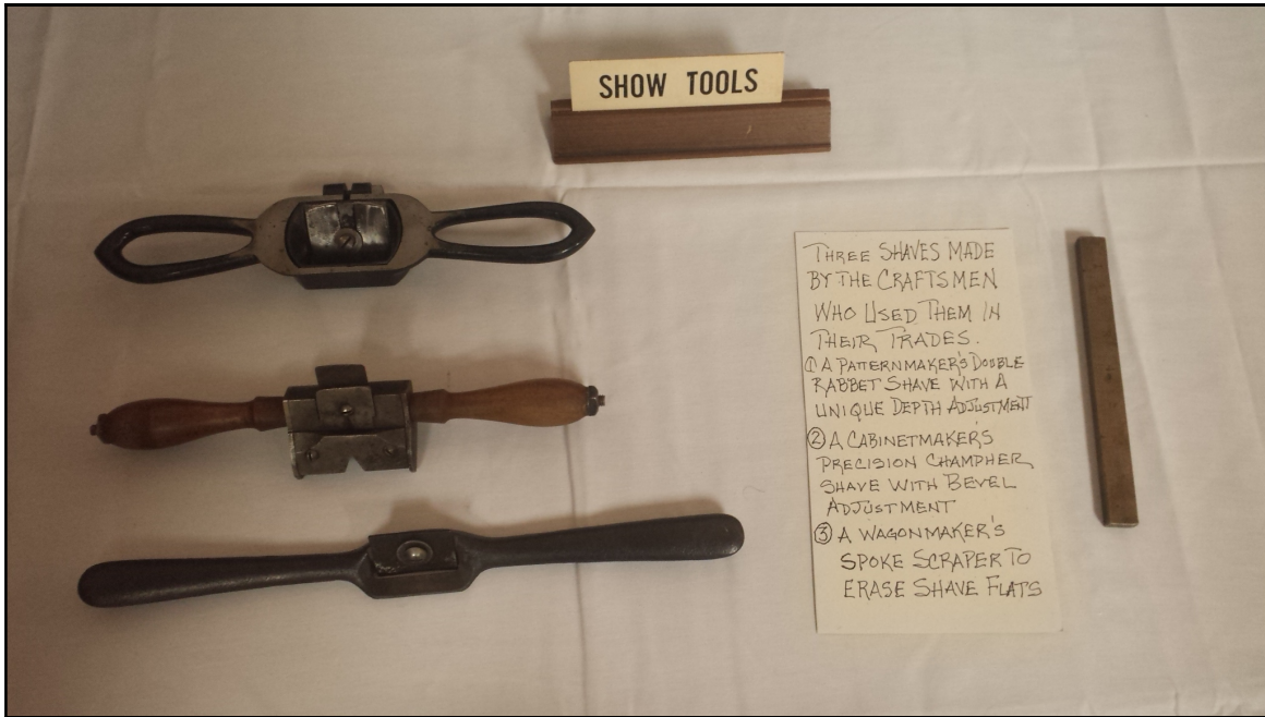
Show Table Items courtesy of Frank Flynn