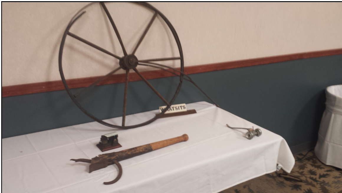
What's It Table items